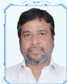
Shri. Damodara Raja Narasimha Garu Hon'ble Minister for Health & Family Welfare, Govt. of Telangana