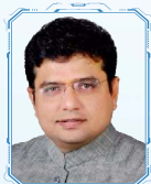
Shri. Duddilla Sridhar Babu Garu Hon. Minister for IT, Electronics & Communications, Industries & Commerce, Govt. of Telangana